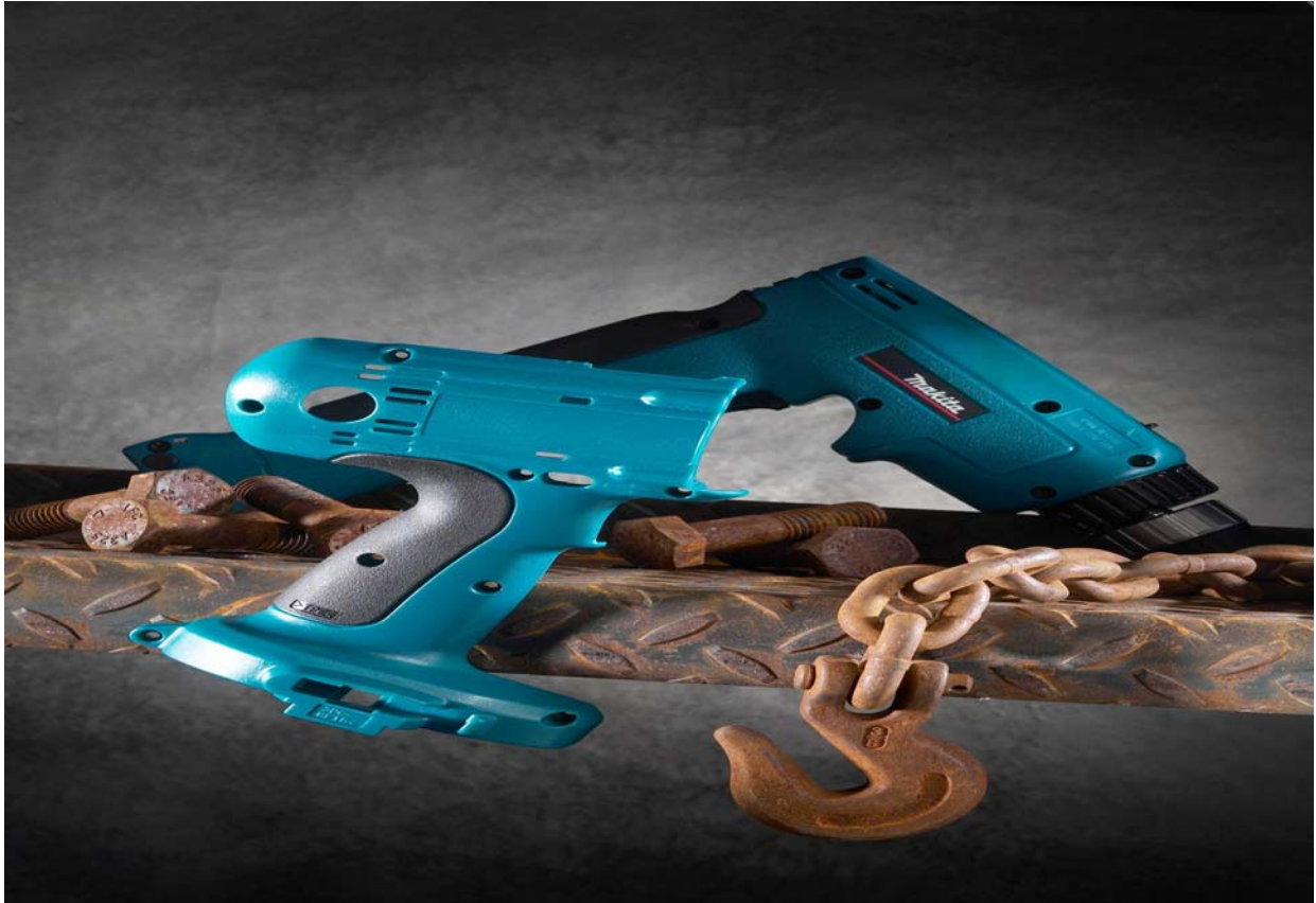
Good looking rubber parts with fast cycle times and reusable scrap define DuraGrip®

The 6000 and 6100 Series of DuraGrip® have been developed especially for the Injection Molding and Overmolding Processes. The 6000 Series bonds to PP and PE, while the 6100 Series bonds to PC, ABS, Nylon 6 and Nylon 6,6, respectively.