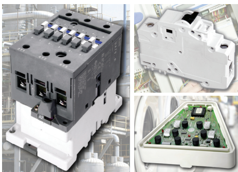
Connectors, circuit breakers, housing molded from non-halogenated Zytel® PA66 and Zytel® HTN meet demanding requirements for low environmental impact, high-temperature assembly and reliable service.

Choose the resin that best fits your electrical/electronic part's particular requirements from the industry's broadest portfolio of non-halogenated flame-retardant engineering polymer grades; our offering embraces two polymer families: PPA and PA66.